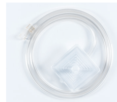
CATSmart vacuum line with integrated Hydrophobic filter