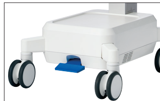
On-board Modular Design