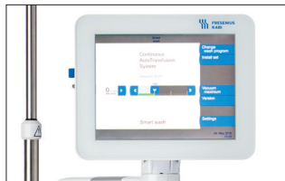
Touch Screen Control